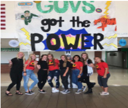
Riggs students admire the poster made in the main lobby.