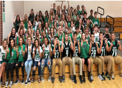
The class of 2020 pose by holding up '20.