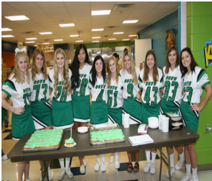
Varsity football cheerleaders help at the spirit breakfast.